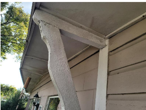
Exterior(001) A-Wall, Center Wood Soffit Support Lead-Positive, Intact